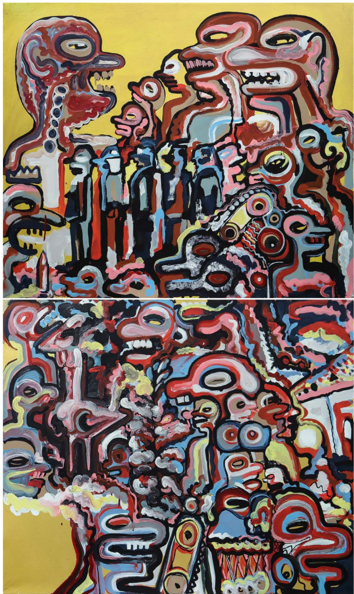
The Lost Gold of the Crown. Acrylic on canvas. 100 cm x 80 cm (set of two pieces). 2019.

From 2012 on, Riera runs his open atelier RIERA STUDIO, with the objective of creating an autonomous space for dialogue, diagnosis and cooperation amongst alternative discourses dealing with Cuban art, supporting primarily the presence and development of peripheral art beyond the centrist current. Since 2013, he creates and organizes Art Brut Project Cuba, aimed at building an action programme throughout Cuba that allows to recognize, catalogue, support and promotes the work of Cuban Art Brut and Outsider Art creators.